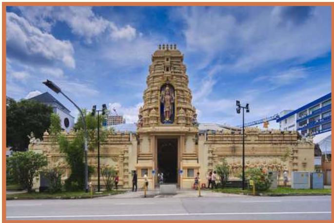
Sri Vairavimada Kaliyamman Temple (SVKT)

In 2024, the Singapore Malayalee Hindu Samajam had a meaningful year with devotional observances, community rituals, and spiritual sessions, all the while staying true to our values of faith, service, and unity. From temple-based festivals to virtual recitations, each event has deepened our connection to tradition and culture, and has brought devotees together from across generations.