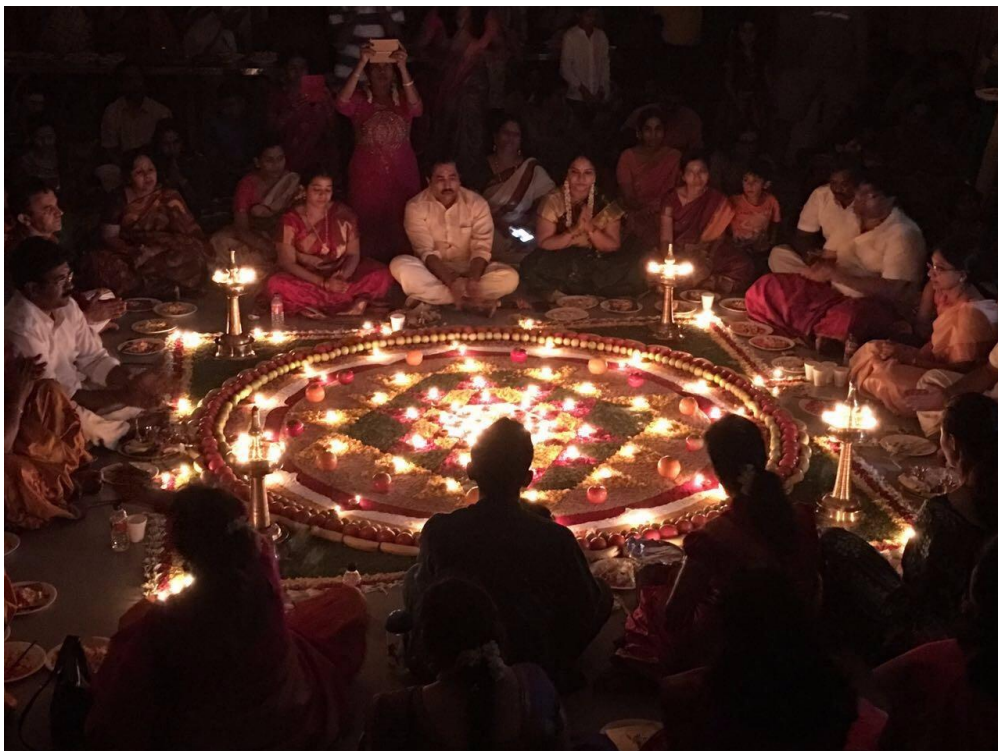
[The Chakram after lighting up of all the lamps towards the end of the Puja]